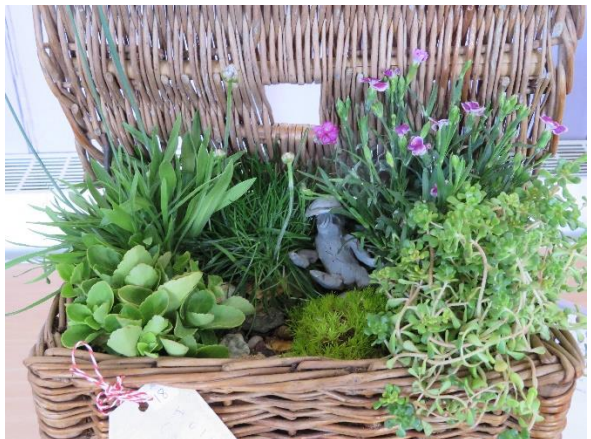
Arlo's winning container garden